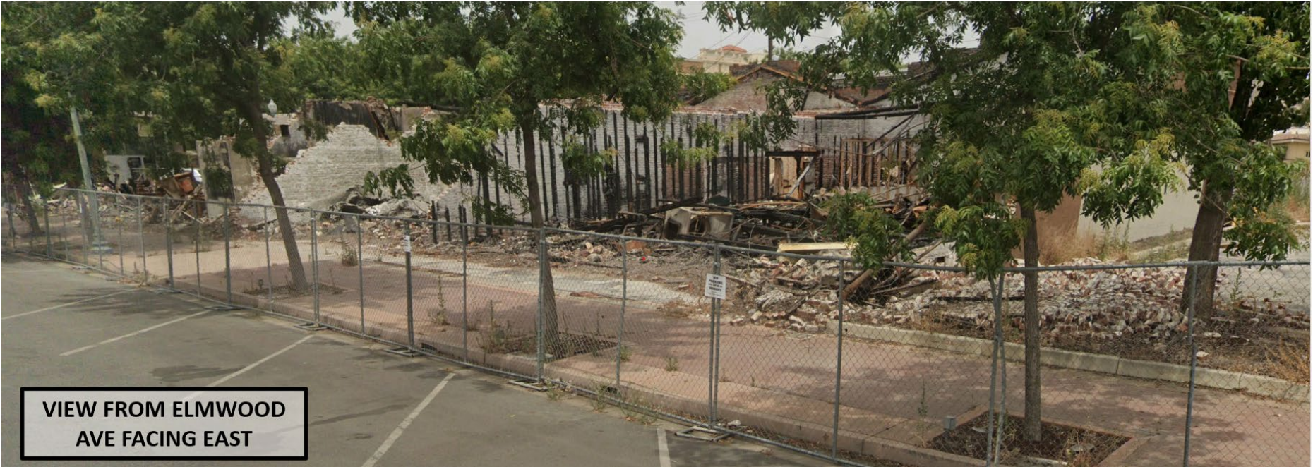
VIEW FROM ELMWOOD AVE FACING EAST