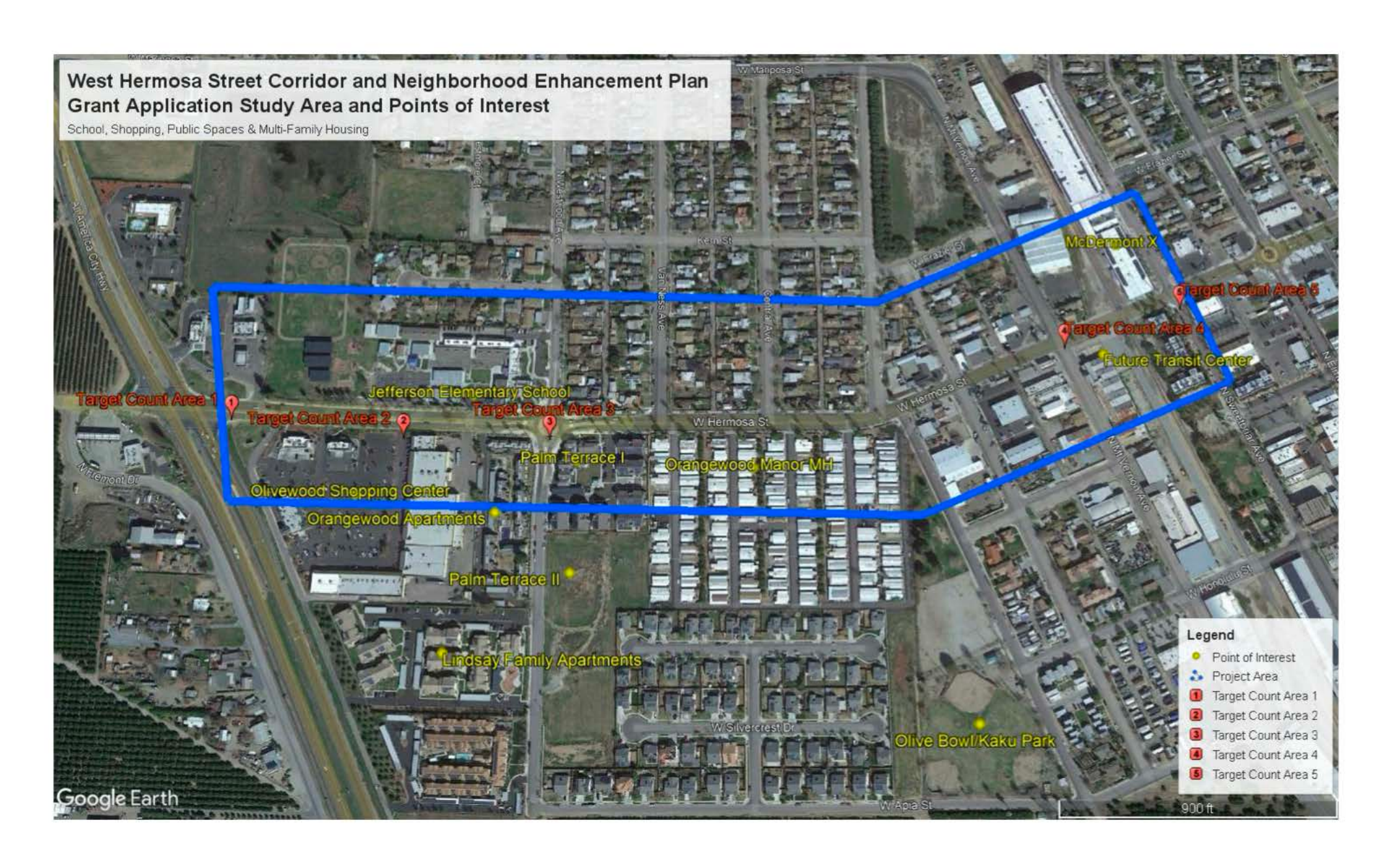
FIGURE 1 – PROJECT LOCATION MAP WEST HERMOSA STREET FROM HIGHWAY 65 TO SWEETBRIAR AVENUE